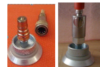
Valves 1 left and 2 right

Note : for thermocouples type K specify .